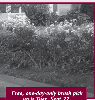
Free, one-day-only brush pick up is Tues, Sept 22.