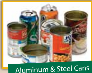
Aluminum & Steel Cans