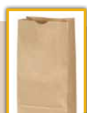
Brown Paper Bags

* ONLY BOTTLES WITH NECKS Don't worry about the numbers.