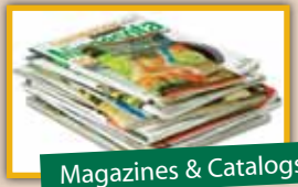
Magazines & Catalogs