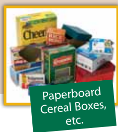
Paperboard Cereal Boxes, etc.