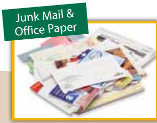
Junk Mail & Office Paper