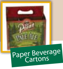
Paper Beverage Cartons