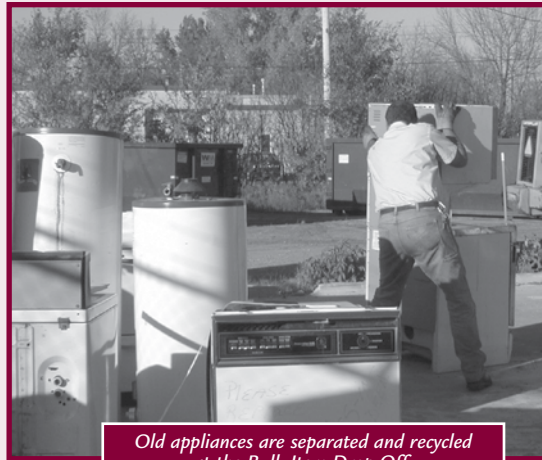
Old appliances are separated and recycled at the Bulk Item Drop Off.