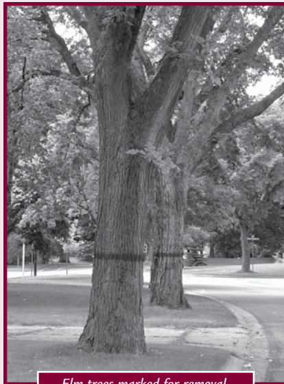
Elm trees marked for removal.

Trees are a priceless asset to your property, neighborhood, and community. Residents are urged to maintain and plant trees, especially those lost due to Dutch Elm Disease. To encourage a community wide reforestation effort, the City plants trees for homeowners on boulevards and other City property (some restrictions apply). The City purchases these trees in the fall of each year at quantity discount prices. If you desire a tree on your boulevard, call the Forestry Division of Public Works at 952-548-6372. 🍓