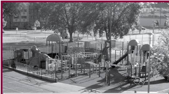
The playground at the former Katherine Curren Elementary School building has been opened to public use.

The Hopkins School District has granted public access to the relatively new and expansive play equipment area adjacent to the recently closed Katherine Curren Elementary School at 1600 Mainstreet. This very popular, high-end play equipment with rubberized surfacing is a welcome addition to the City's neighboring Central Park. The play equipment, installed in 2003, won't be needed by the charter high school that will move into the building this fall. The School District graciously granted a 30-year easement over this area to the City for continued use as a community play area. The City will take over maintenance responsibilities. 🍓