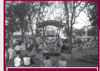
A crowd enjoys the Minnesota Mandolin Orchestra last August.

For more information call 952-988-5350. 🍷