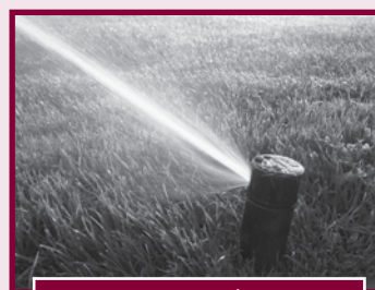
Less water on your lawn means more water for fire fighting

Exemptions are also available for items such as new sod or landscaping. Please call the Water Department at 952-548-6373 with any questions. 🍓